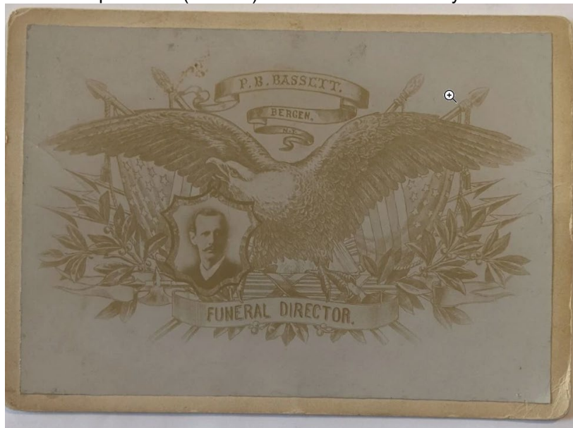
GAZATTEER BIOGRAPHICAL RECORD GENESEE COUNTY, N.Y. Jan 1890