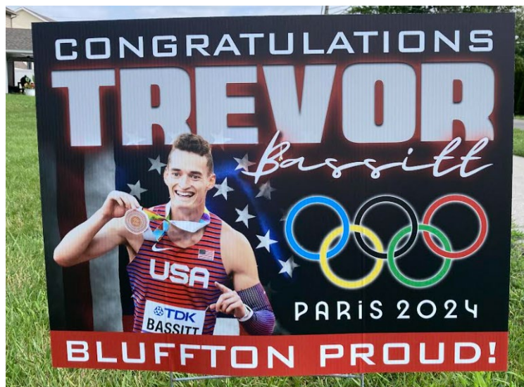
Yard Sign from Bluffton, Ohio Celebrating Trevor Bassitt's participation in the 2024 Olympics