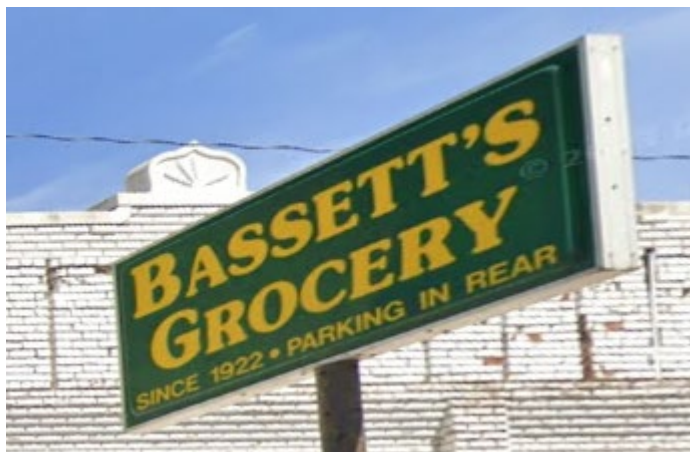
Bassett's Grocery Store, Afton, Oklahoma