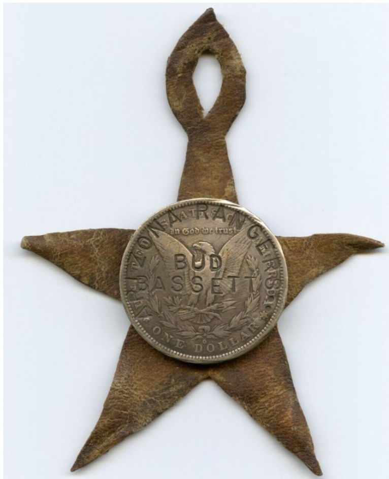
Bud Bassett Arizona Ranger Star Badge currently for sale on ebay