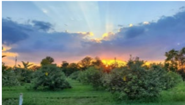
Cool Apple Orchard at sunset