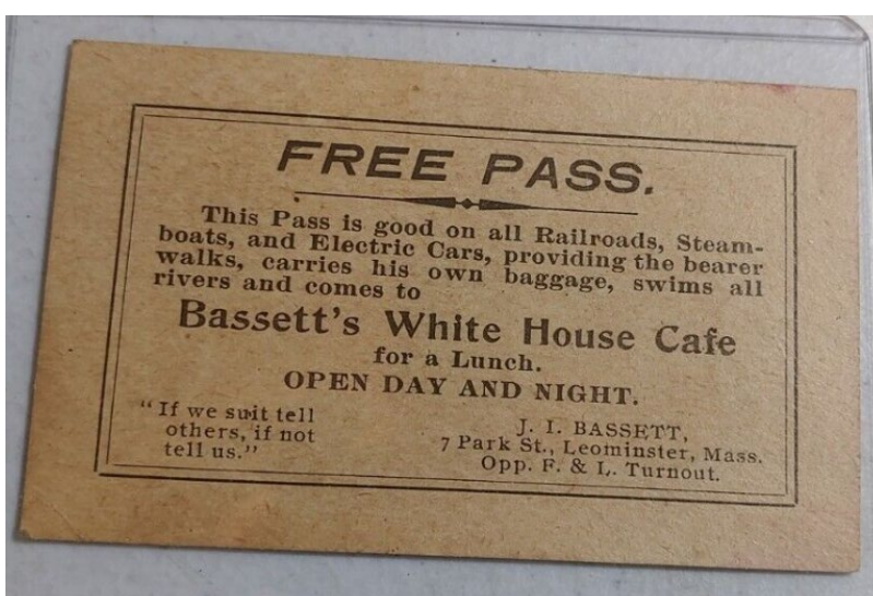
Trading card for sale on ebay this week.