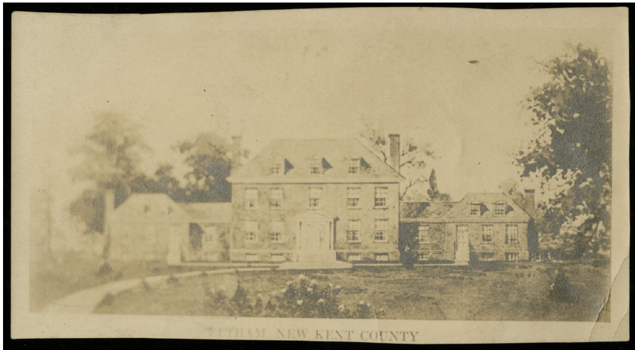
Photograph of Eltham Plantation, New Kent County, Virginia Photo taken before Saturday, May 8, 1875 when the home was gutted by fire.

Conway Whittle Family Papers Box 16, 76 W61, in the special collections library at William & Mary