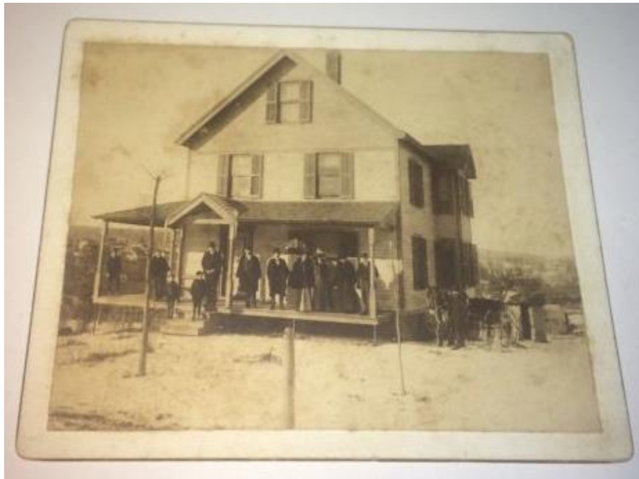
Picture for sale on ebay. Identified as the Bassett Home, Bristol, Connecticut Taken Winter of 1897.