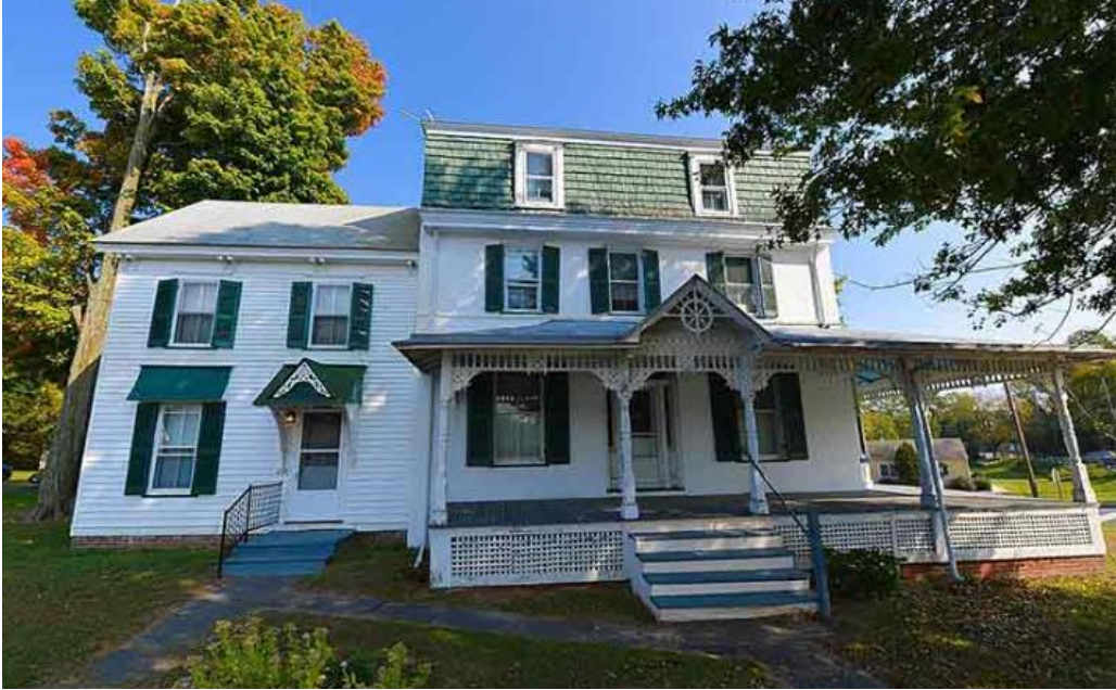
David Bassett House of Woodstown, New Jersey recently for sale