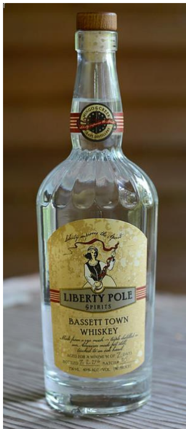
Bassett Town Whiskey, Pennsylvania

Totals number of individuals loaded into the Bassett website: 144726