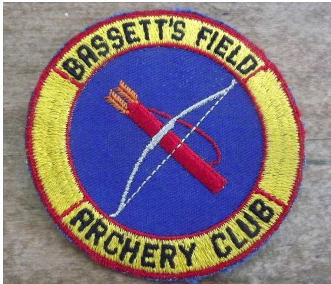
Patch found for sale on ebay.

Totals number of individuals loaded into the Bassett website: 144,072