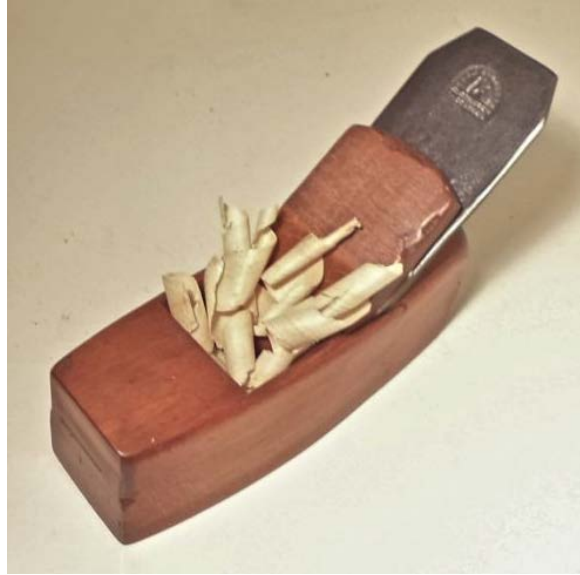
D. Bassett Plane