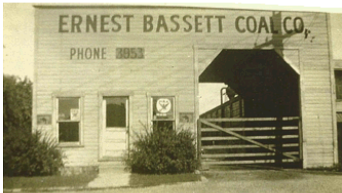
Ernest Bassett Coal Co. Office located in Kokomo, Indiana