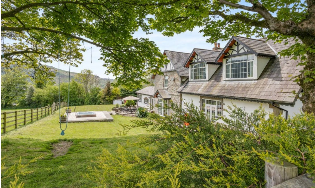
A Picture of present day Havod Gannol (Hafod Ganol) Farm in Wales. This property can be rented out.