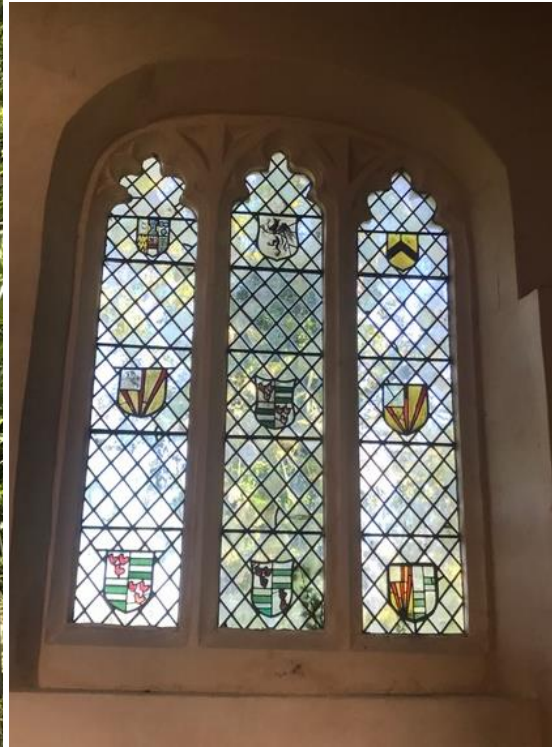
Stained glass with several Bassett coats of arms