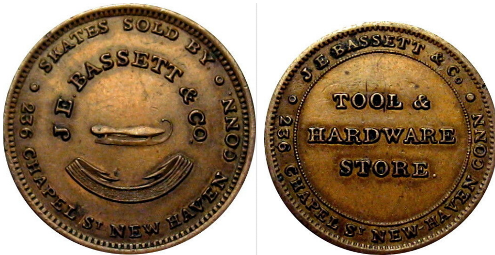
J.E. Bassett & Co. Coin for sale on ebay.