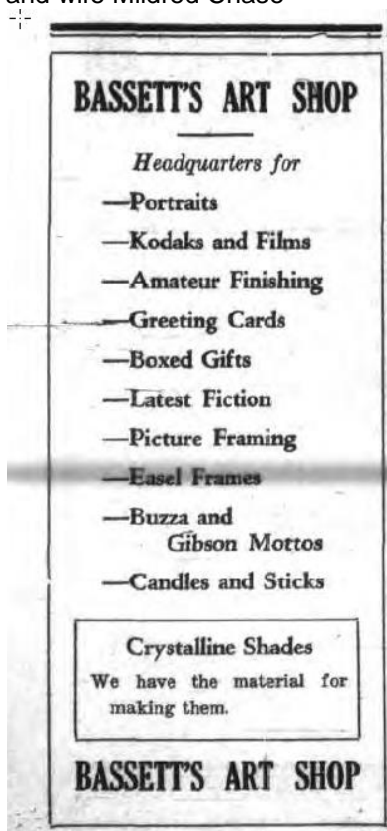
Perry Record, Perry, New York, June 17, 1916