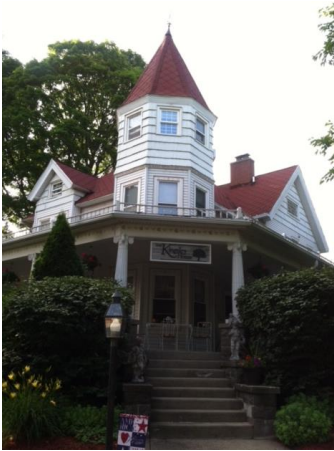
Picture of Kingsley House