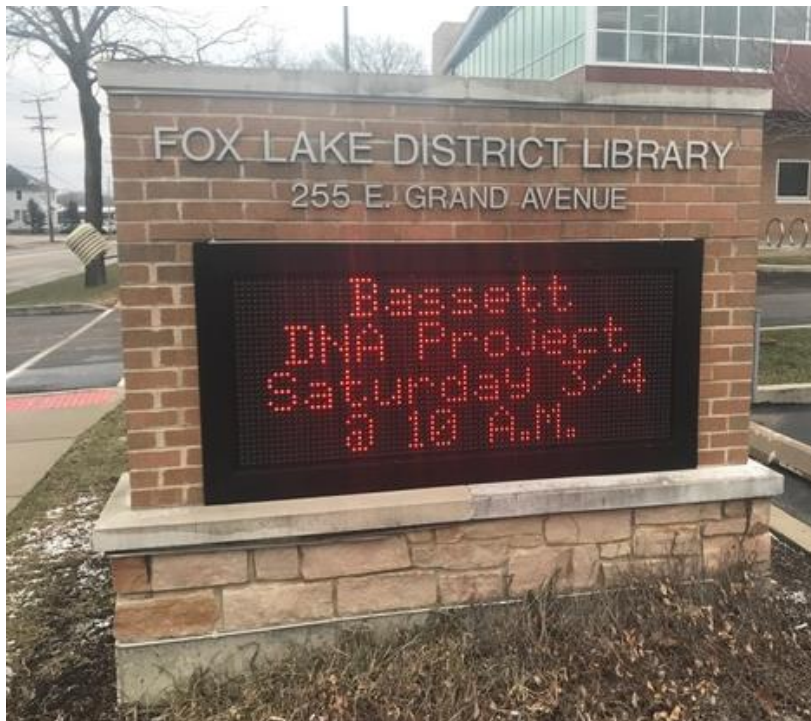
My last DNA project talk

Totals number of individuals loaded into the Bassett website: 143,585