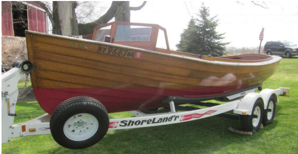
A rare 1932 J.R. Bassett guide boat recently for sale on Boats-from-usa.com.