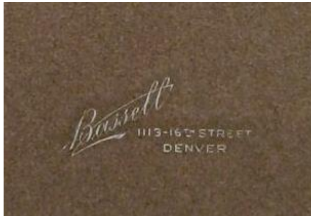
Bassett Photography Studio, 1113 16th Street, Denver, Colorado

Totals number of individuals loaded into the Bassett website: 141.065