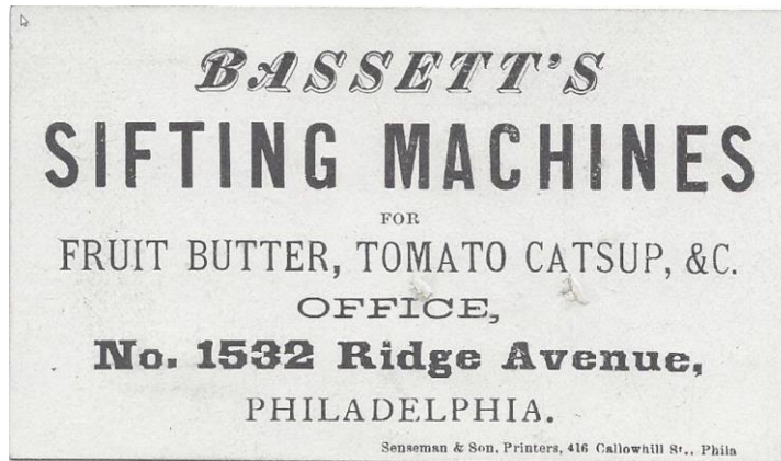
Trading Card recently for sale on ebay