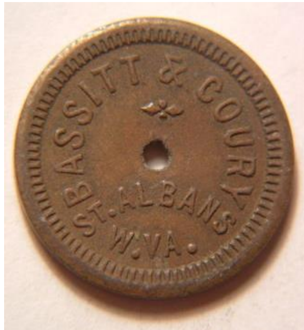
Bassitt & Courry Trading Coin, St. Albans, West Virginia

Totals number of individuals loaded into the Bassett website: 140.902