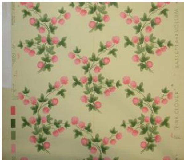
Bassett & Vollum wallpaper from the Collection of Cooper Hewitt, Smithsonian Design Museum