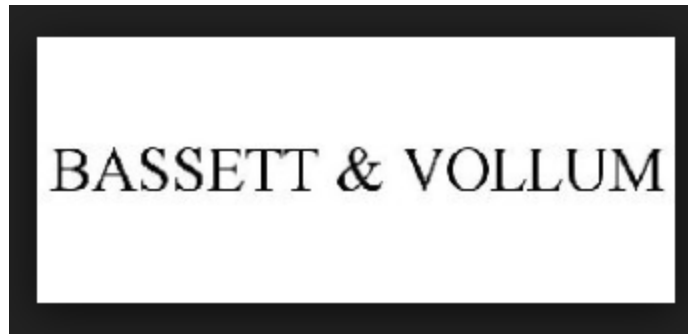
Bassett & Vollum Trademark