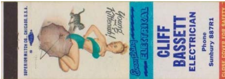
Match book cover for sale on ebay of Cliff Bassett Electrician

The Daily Item on 9/20/2005 Clifford D. Bassett