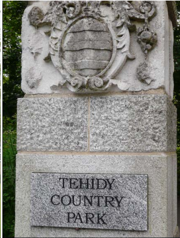
Current picture of Tehidy Park