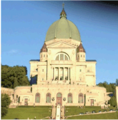
Saint Joseph's Oratory, Montreal, Quebec Joseph's Oratory