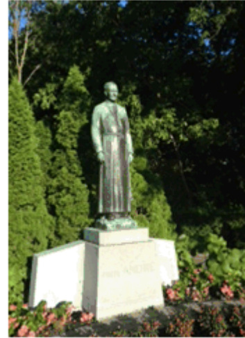
Statue of Brother Andre on the grounds of Saint