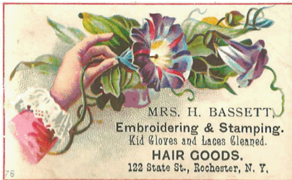
Advertising Card found on ebay.

No other information is known at this time.